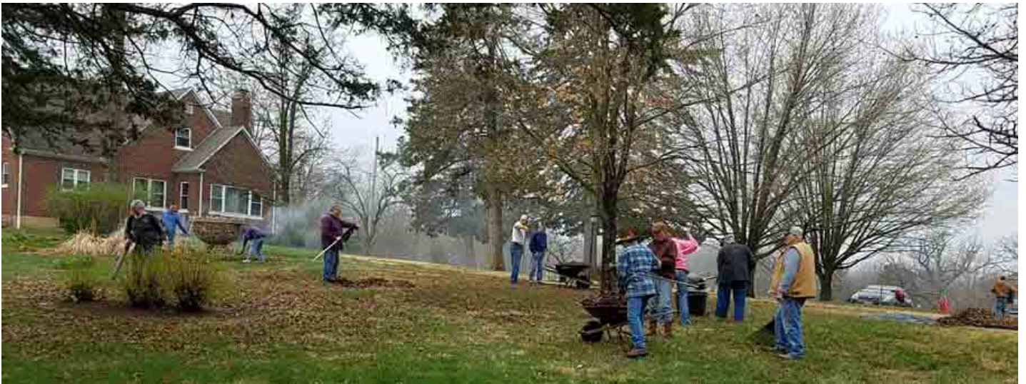
Cleaning out the Storage area.