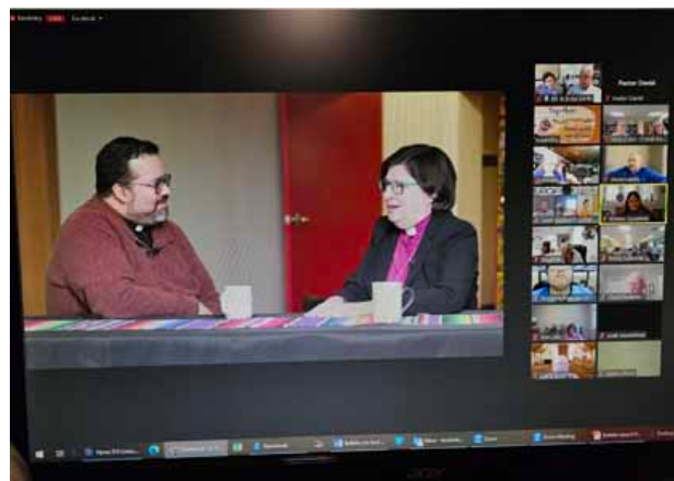
Bishop Eaton Interview on ZOOM

It was an honor and a privilege to represent St. Paul's Lutheran Church in Lohman as voting congregational delegates to the 2023 Central States Synod Assembly held on Saturday, June 3, 2023. The online virtual format (Zoom) of this assembly was very efficient and packed synod business, reports of the wide-ranging activities of group worship, synod organizations, and election of officers into six (6) hours of fast-paced work and worship. The theme of the assembly was "Together: Traveling the way of Jesus."